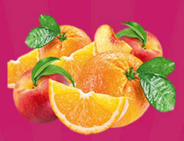
Orange & Peach