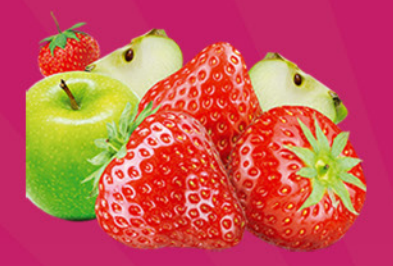
Strawberry & Apple