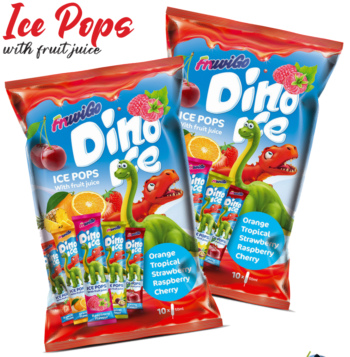
Mixed fruit flavours: Orange - Tropical - Strawberry - Rasoberry - Cherry