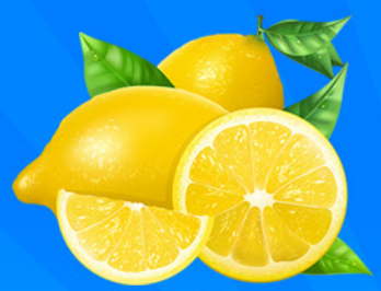
Ice Tea Lemon