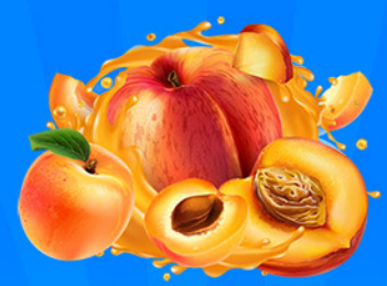
Ice Tea Peach